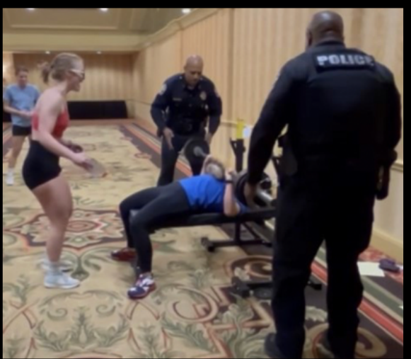
CDT Gaus-Schmidt hitting her 95lb. bench press PR during the physical agility competition