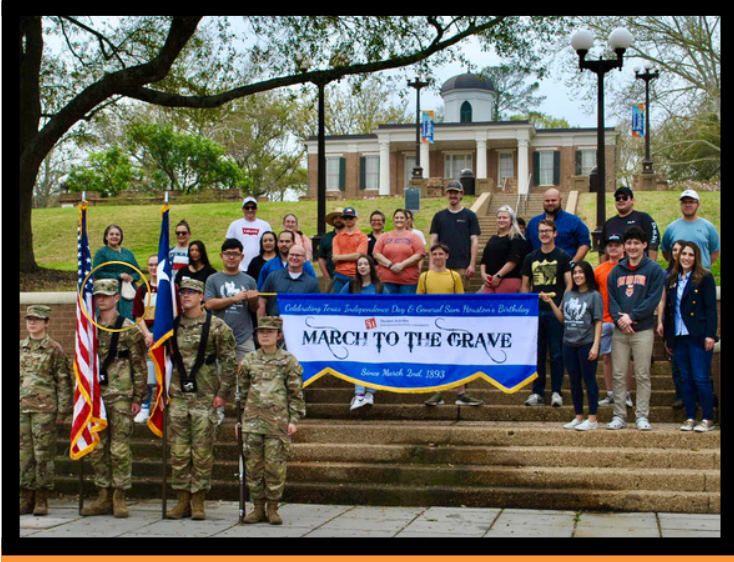
Color Guard with the community during March To The Grave