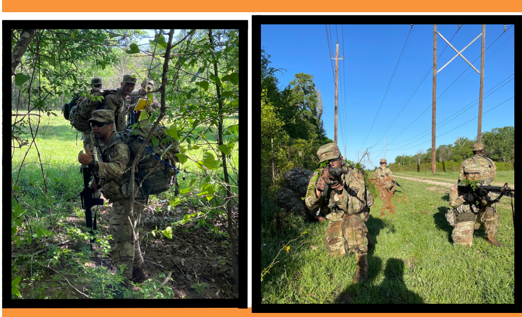
SHSU and SFA Cadets during an Ambush mission at the MPFTX