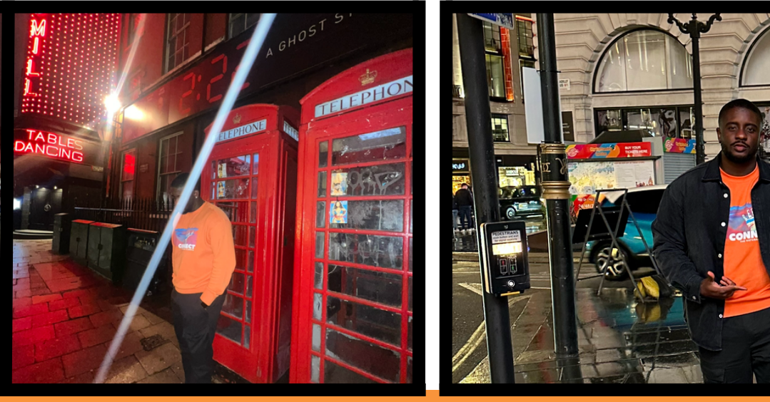
CDT Olatunji at Piccadilly Circus, London, UK